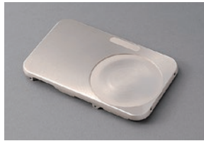
digital camera case

For other dimensions, please contact us.