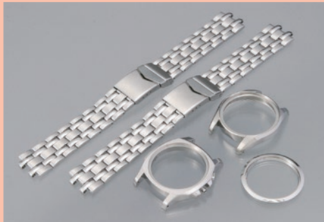
watch cases & bands

watch cases, titanium frames of glasses, hydraulic cylinders before and after plating