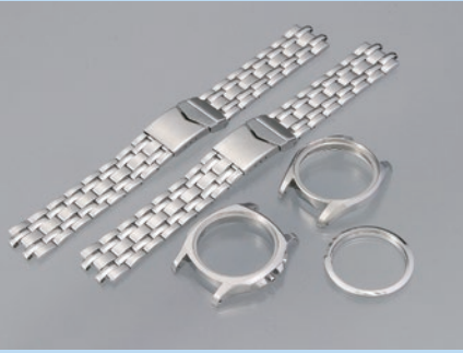
watch cases & bands

watch cases, accessories, necktie pins, and various stainless steel products